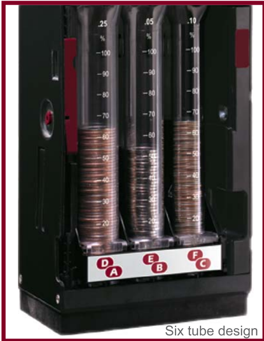
Six tube design