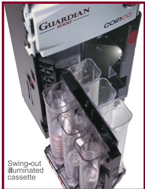
Swing-out illuminated cassette